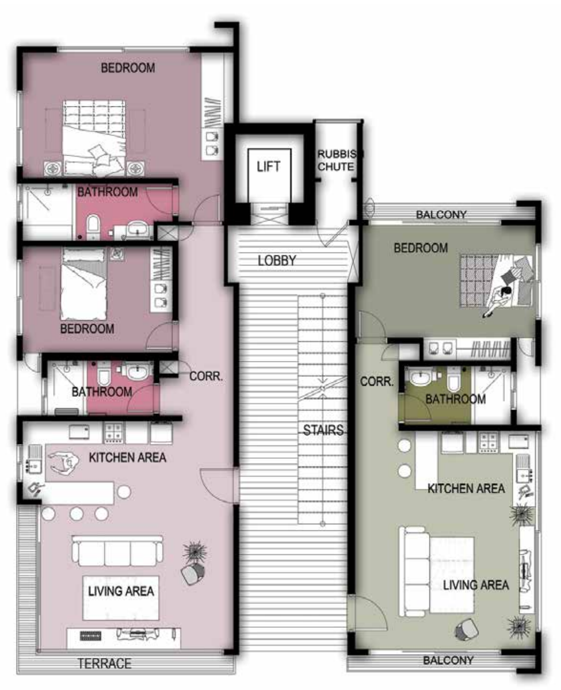
FITH FLOOR PLAN