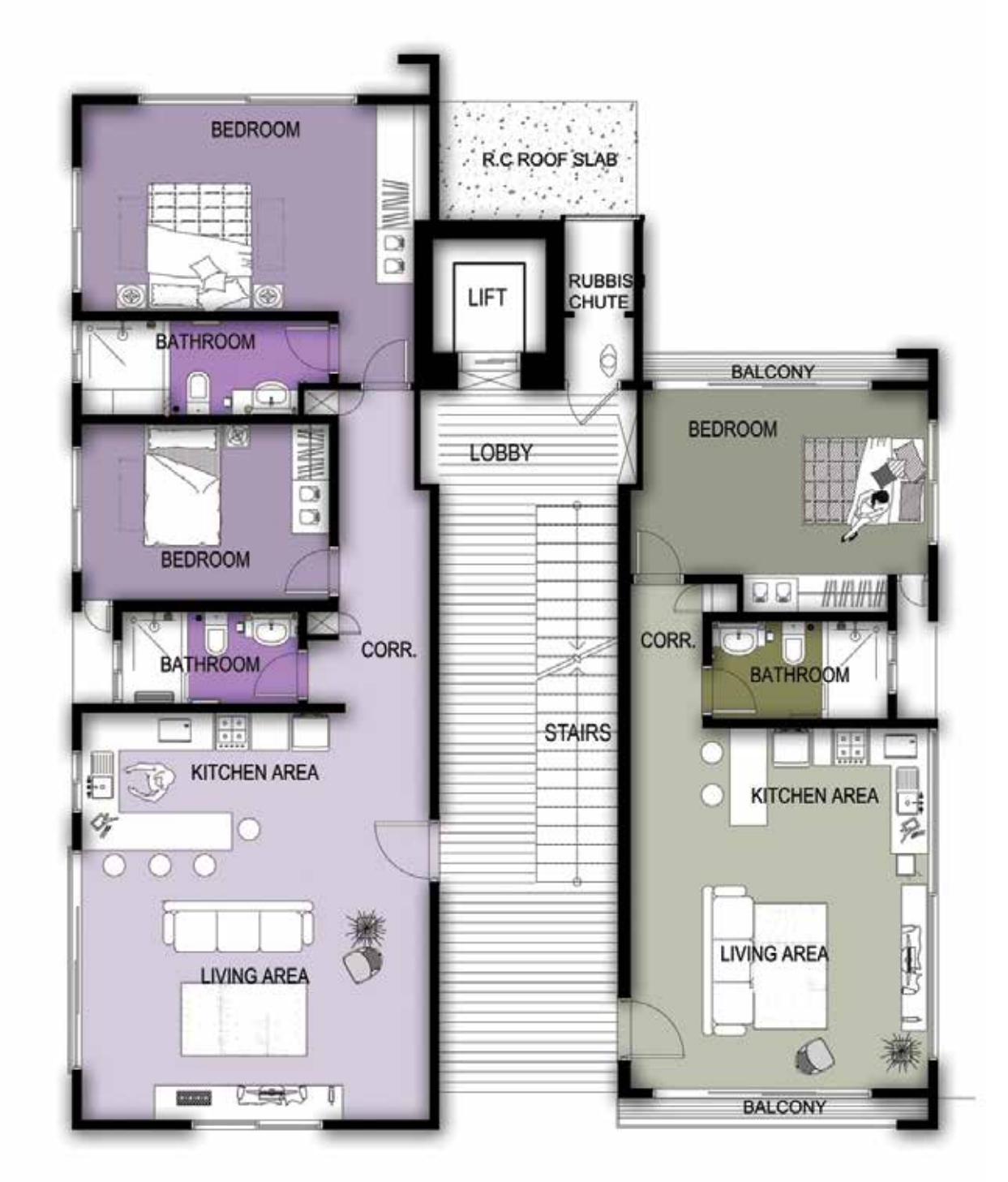
TYPICAL FLOOR PLAN (FIRST TO FOURTH FLOOR)